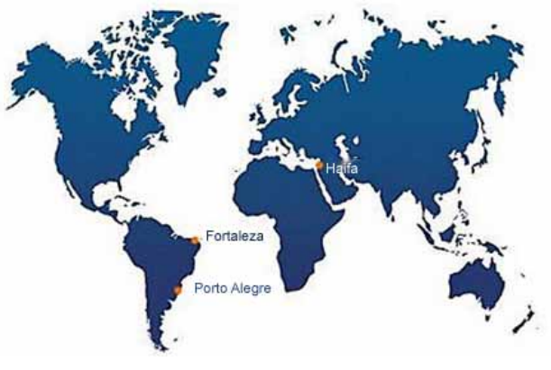
Figure 1. Teams setting

One of the issues identified during this research was the chronological dispersion. Israel and Brazil are separated by a 5-hour time zone difference (as represented on Figure 2), reducing communication window and time for solving doubts.