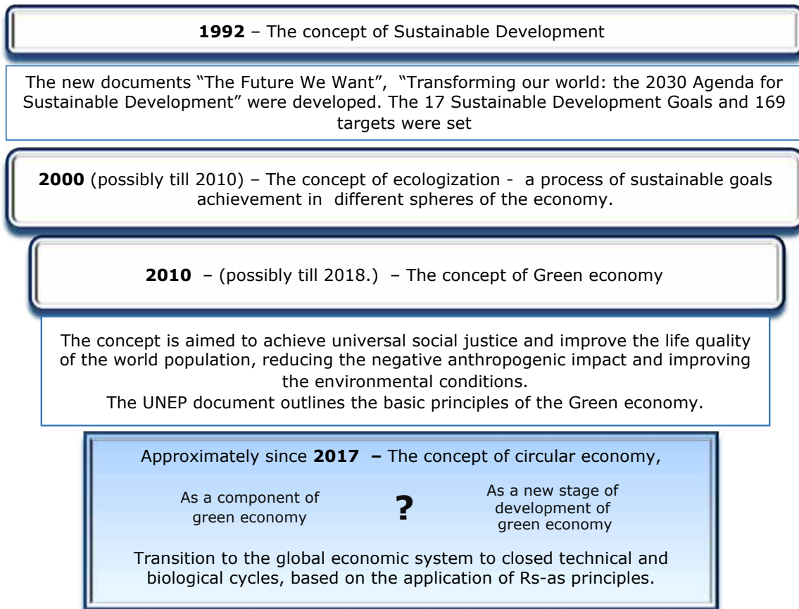
Figure 1. The path to the formation and popularization of the economics of environmentalism (prepared by the authors based on the works by Batova et al. (2018) and Gureva (2013)).

The key difference between the initially accepted concept of sustainable development and the later concept of the circular economy is the expansion of its sphere of concepts, because in the interconnection of environmental and economic spheres, a greater merger occurs through the necessary interaction (Figure 2).