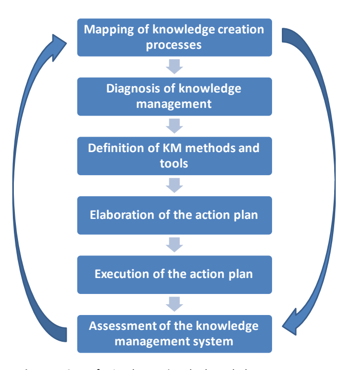
Figure 1. Steps for implementing the knowledge management model for a core of technological innovation